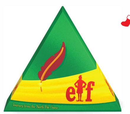
Elf - Journey from the North Pole

$19.99 Ages 8+ Available at Target Available 10/1